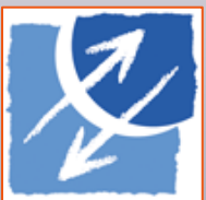
The Max Planck Institute of Biochemistry

Research has shown that some major and well characterized components of the Core Invasive platform such as integrins and their proximal effectors are regulators of cancer progression and metastasis outgrowth in multiple ways. The signals initiated by ECM-integrin interactions are transduced into cells through the activation of a large and discretely localized intracellular signalling network which drives migration and invasion.